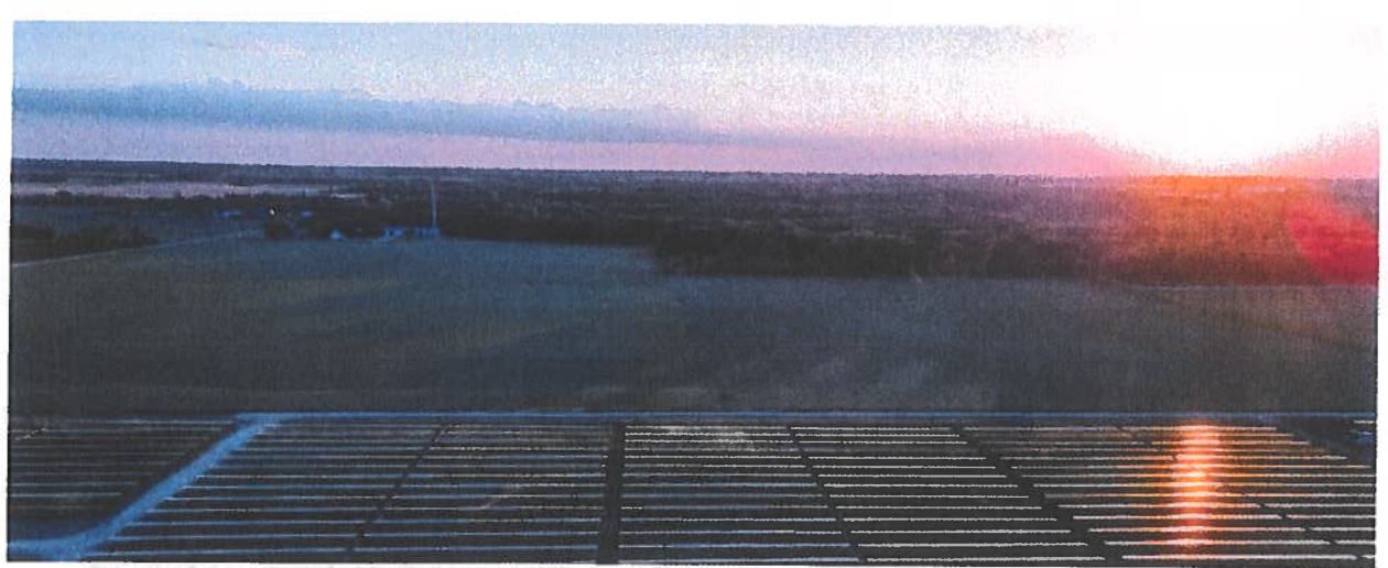
Figure 2-1 3MW project in Will County, Illinois developed by Cypress Creek

The Project will take approximately 12-16 weeks to construct. The Project will not require manned labor on-site, nor will it require sewer, water, or other services. The Project will be completely enclosed by a 7' tall fence per National Electrical Code regulations.